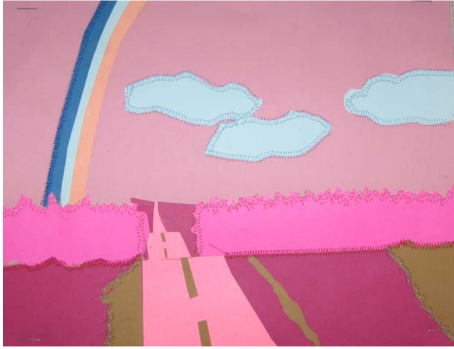
Claire Grade 6