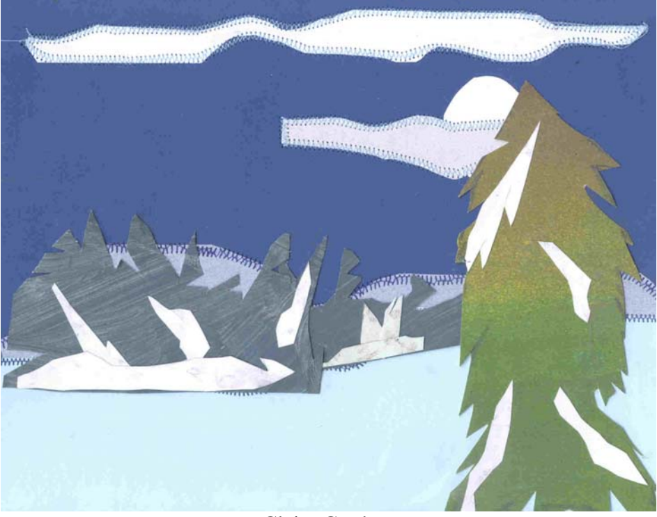
Claire Grade 6